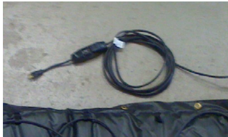
Standard 120V exterior rated 30mA GFI power cord, 20 feet in length