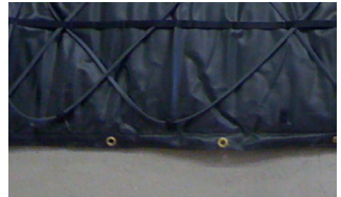
Evenly spaced grommets for easy access to tie down onto the roof